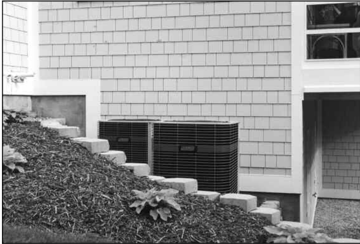
Lennox International Inc.